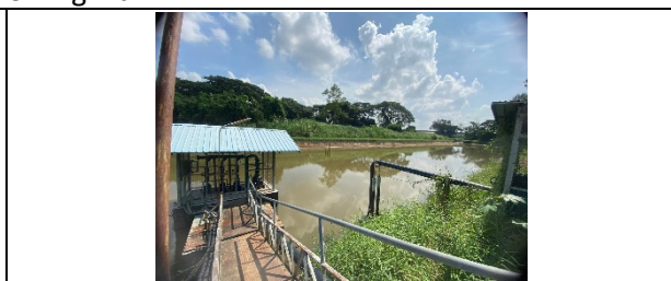
Water intake pipe for treatment process