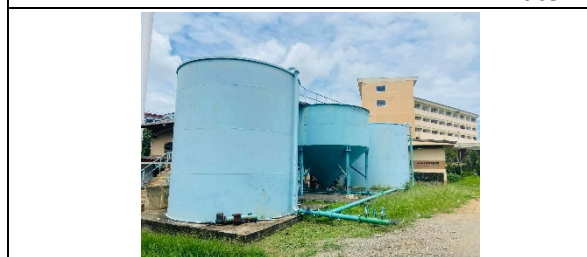
Water treatment facility